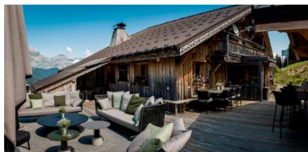
ALPAGE DE PORREZ

A unique concept all over the world. The restaurant La Fruitière, welcomes you for a fine and chic lunch in front of the Mont-Blanc before an amazing cabaret show every day from 2.30pm. Accessible for intermediate and good skiers only.