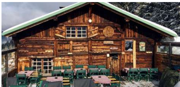
LE CHALET FORESTIER

Gastronomic restaurant at high altitude. Located in an old farmhouse, the Chef will offer you an incredible and more than refined experience. Accessible by snowmobile for dinner.