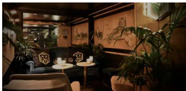
LE TIGRR PRINCESSE

Instead of "Woody", still in a wonderful place with a gorgeous view on the valley. Nice sunny terrace and easily reachable for non-skiers. Asian fine food and a festive atmosphere.