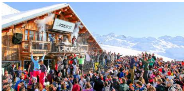
LA FOLIE DOUCE

Instead of "Woody", still in a wonderful place with a gorgeous view on the valley. Nice sunny terrace and easily reachable for non-skiers. Asian fine food and a festive atmosphere.